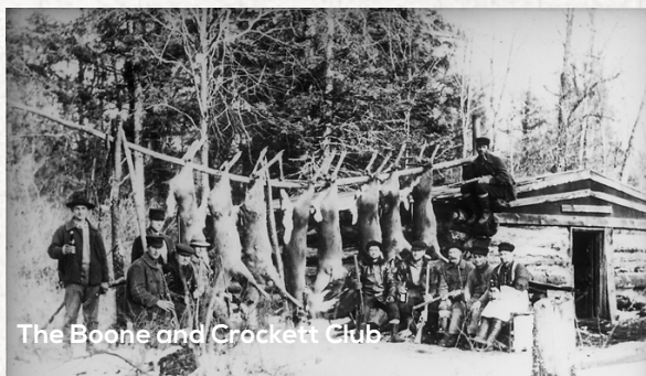
The Boone and Crockett Club

is no scorekeeping, or at least there shouldn't be. To be a Sportsman is to be a gentleman in all senses of the word. A Sportsman will go without filling a tag rather than push others out of the way to get first crack at an animal. A Sportsman will share hunting tactics and